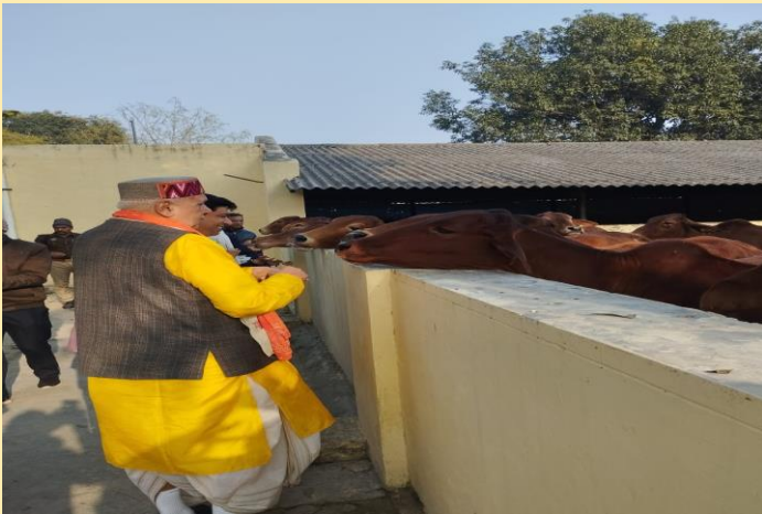
Shri Surya Pratap Sahi, Hon'ble Minister, Uttar Pradesh