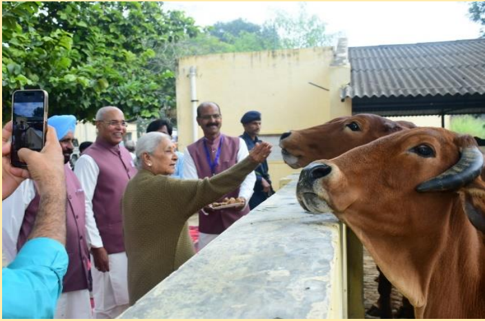
Hon'ble Governor of Uttar Pradesh