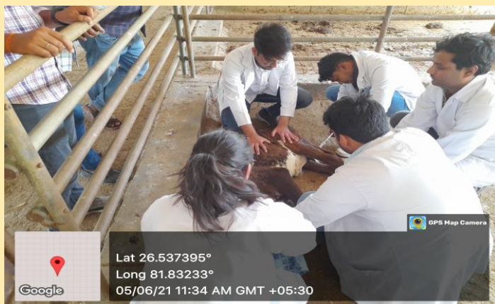
Castration of calf by students